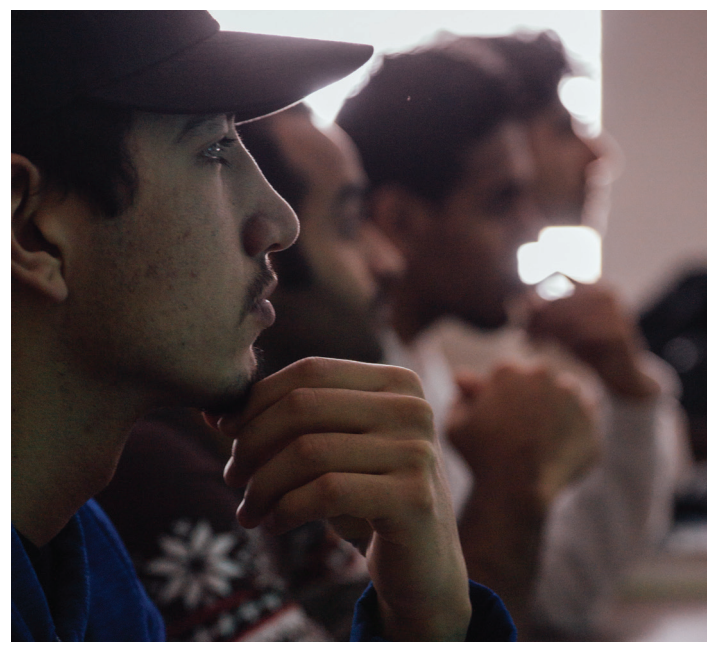
There are a number of similarities between Sim Tech and IT program courses. A program's curriculum and career opportunities help students choose the right path with their interests.

Students learn to use specialized tools, test equipment, built-in diagnostic equipment and technical data to isolate and locate faulty components or system malfunctions. While in the program students will gain experience in electronics, flight characteristics and computers.